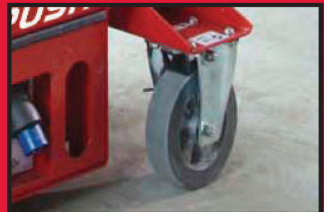
Auto brake prevents surfing