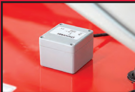
Tilt sensor with built-in isolator only allows use on a level floor