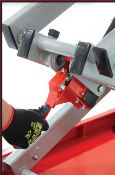
Easy access emergency lowering lever