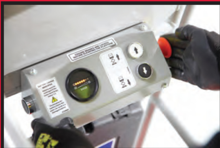
Both hands are safely in the basket when going up or down