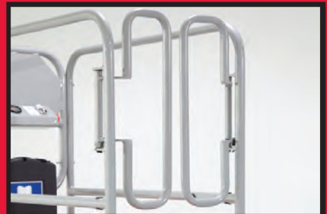
Saloon safety gates close automatically behind you