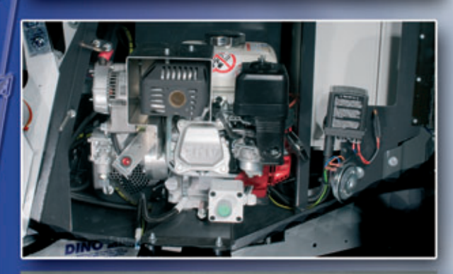
Petrol or diesel power pack is standard - power for lift also without mains.