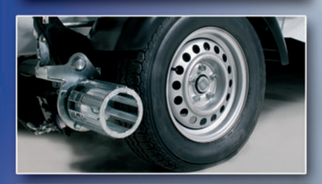
User friendly driving system easy and effortless manoeuvring.