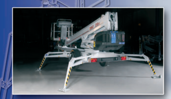
Spider type outriggers large ground clearance, with narrow stabiliser width.